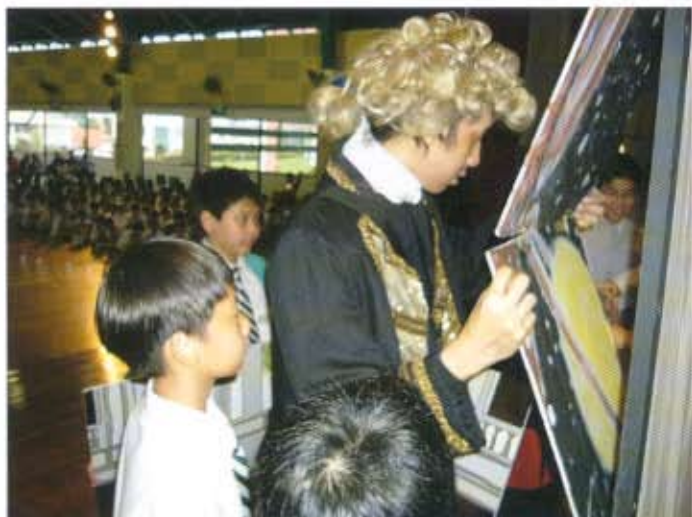
The Act 3 group staged a drama, If Raffles were from Mars , in St. Stephen's. The boys enjoyed the show and participated enthusiastically.