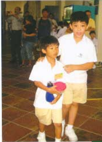
Buddy Programme – training our boys to be 'men for others'.

A community of inquiring learners with faith and zeal, excelling for the glory of God.