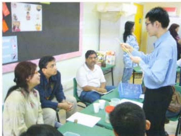
The Parents' Symposium drew a crowd as parents learnt how they could better help their children in their schoolwork at home.