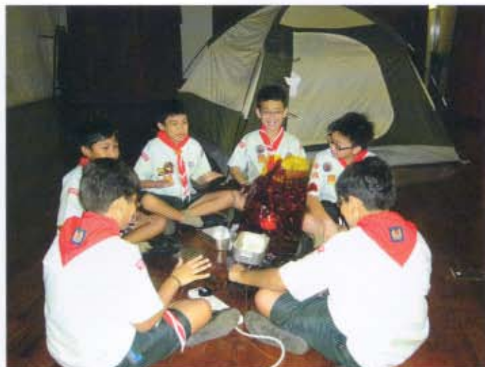
The World Scouts Day saw our cub scouts reaffirm their allegiance and show off what they do at a camp.