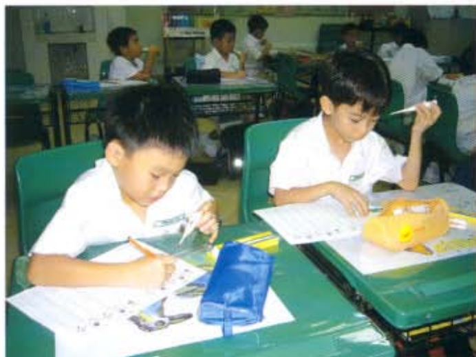
Our boys taking and recording their temperature – an exercise in emergency preparedness.