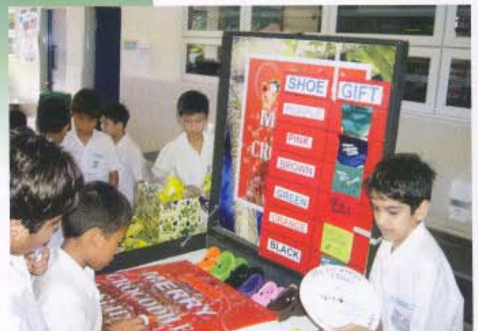
Our boys learnt the intricacies of running a business. Along the way, they also learnt the value of perseverance, respect and honesty.