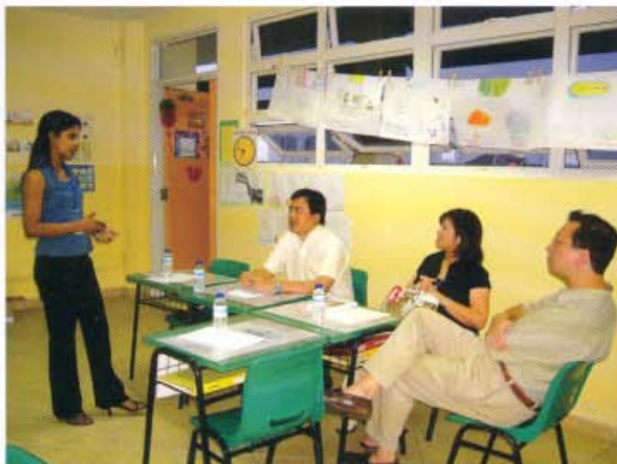
The first term kicked off to a start with a Parent-Teacher Meet in January to get to know one another and convey expectations.