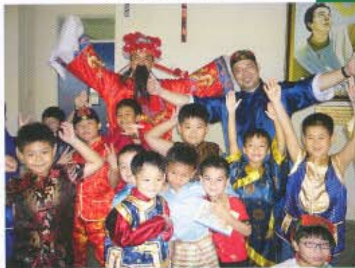
Joy, laughter and merry-making were the order of the day as we ushered in Chinese New Year.