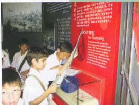
Understanding our cultural heritage through learning journeys – a lesson in respect and tolerance