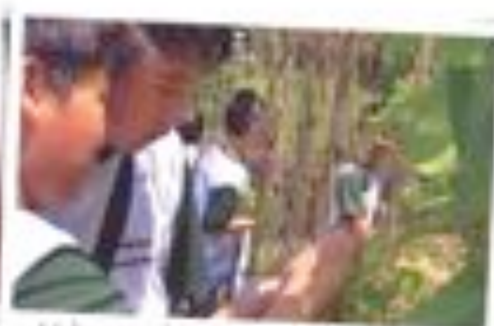
Maths among honey at the Zoo