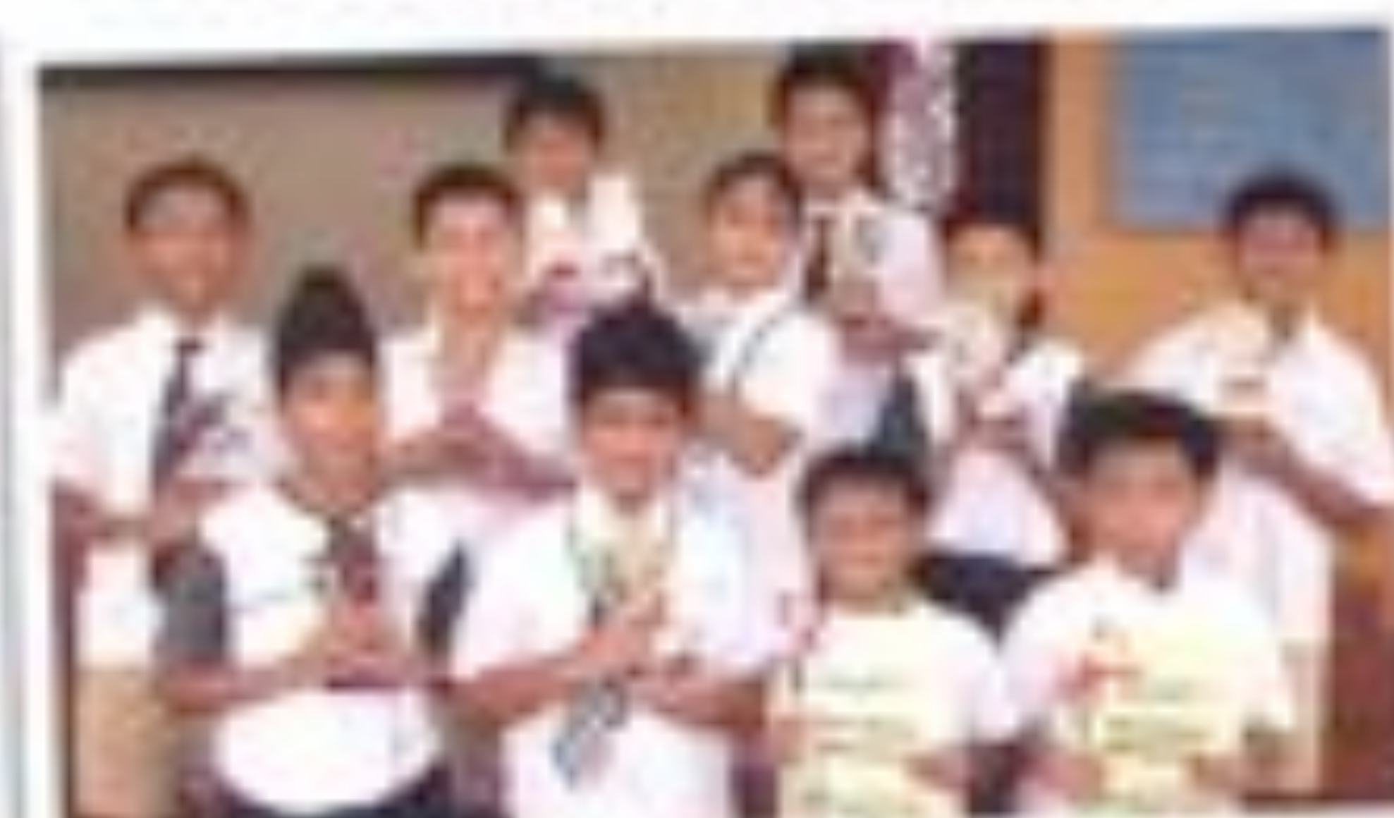
Our proud prize winners!

P5 MT Language Local Immersion Camp 2010, 24 - 26 May