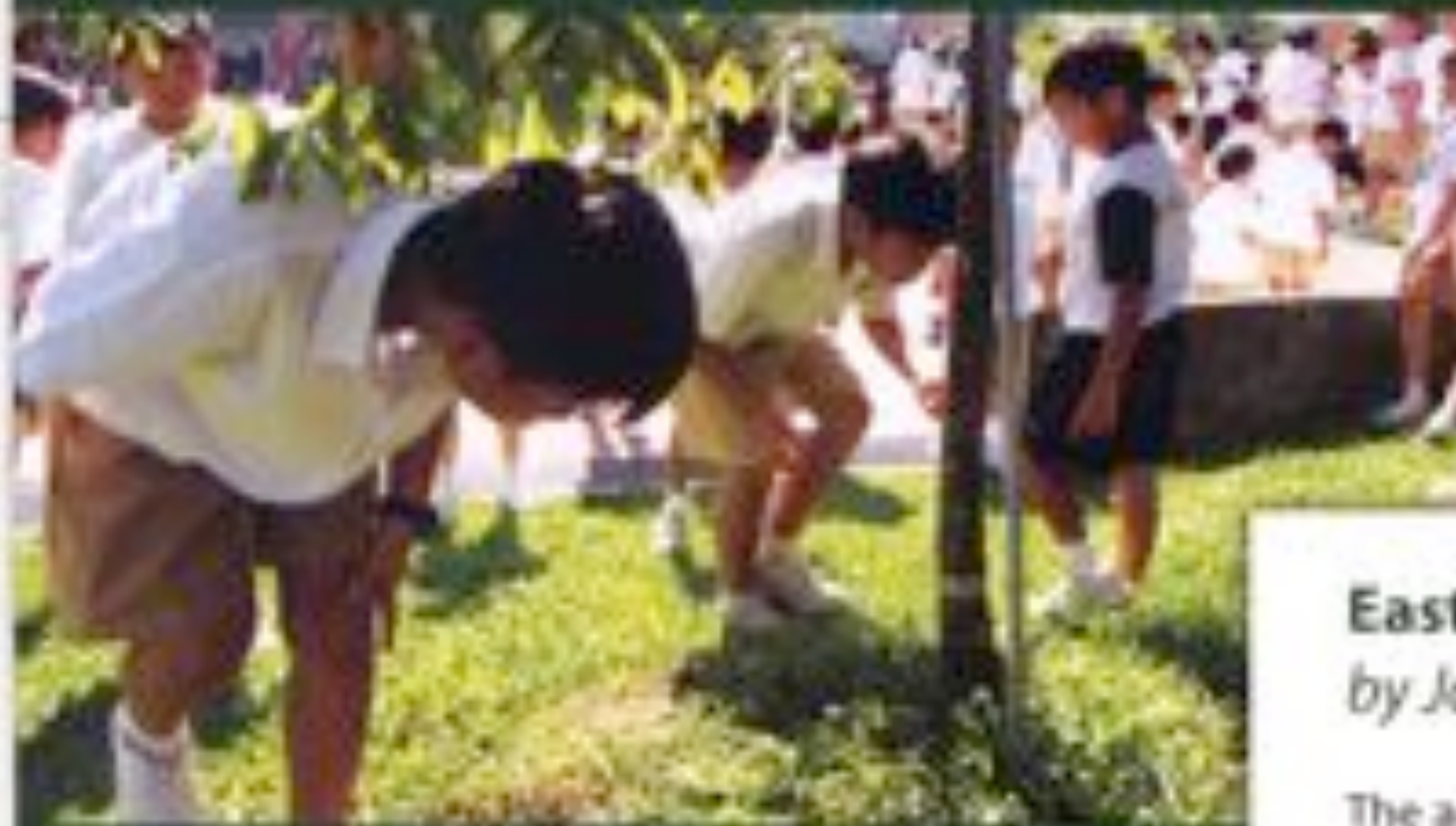
"Oh! I think I've found treasure!"