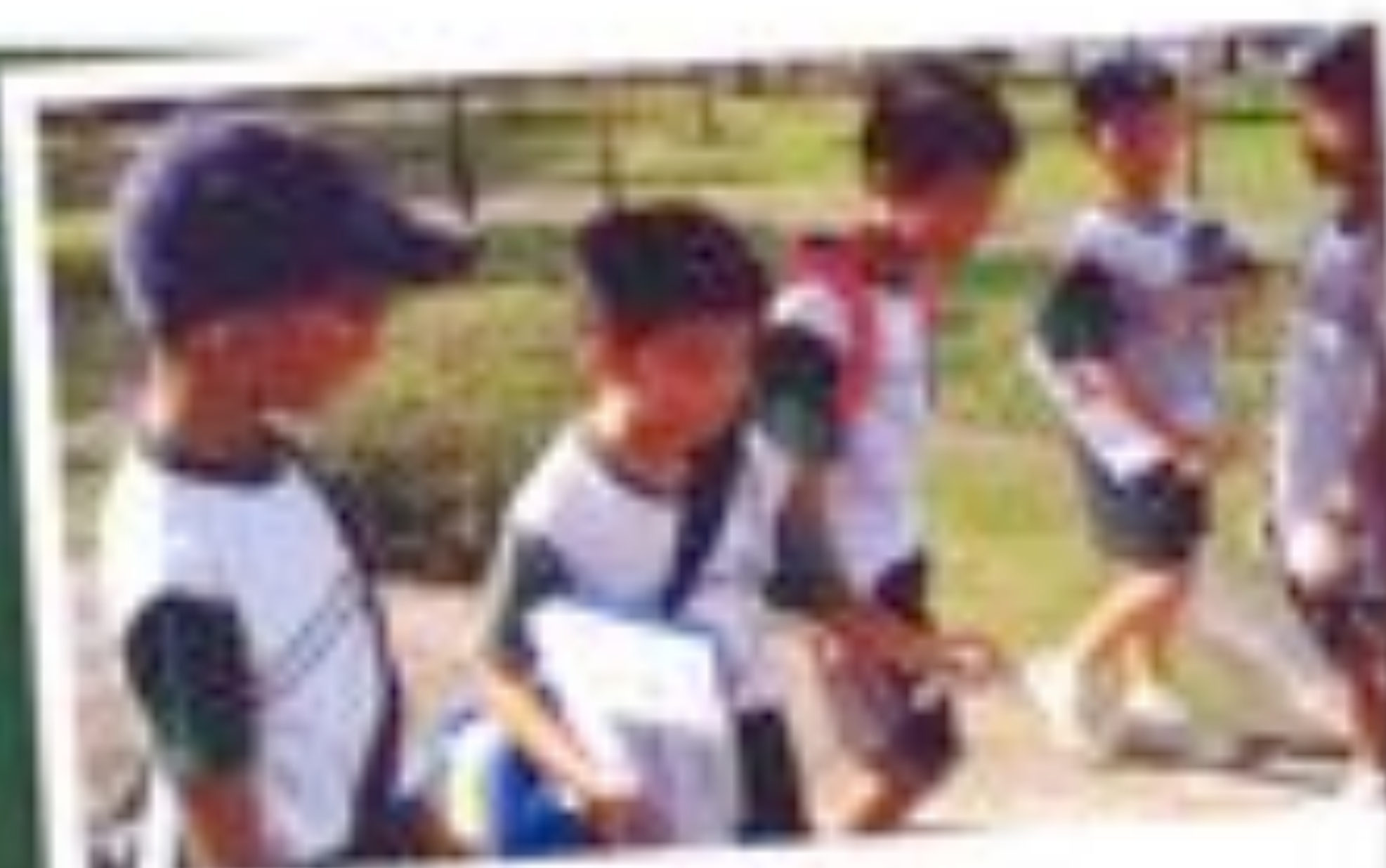
Discussing what symmetry is at Labrador Park

A kaleidoscope of learning journeys and activities that took place this term through pictures