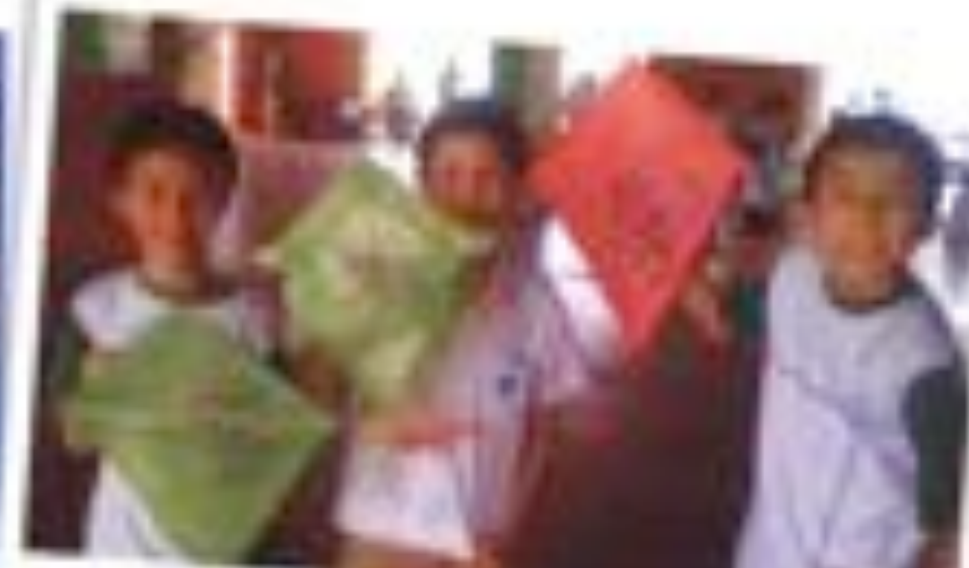
Pupils were engaged in a range of interactive and fun activities conducted by English Language Centre to expose them to creative usage of their Mother Tongue

Bilingual Approach in teaching Chinese Language, 8 March