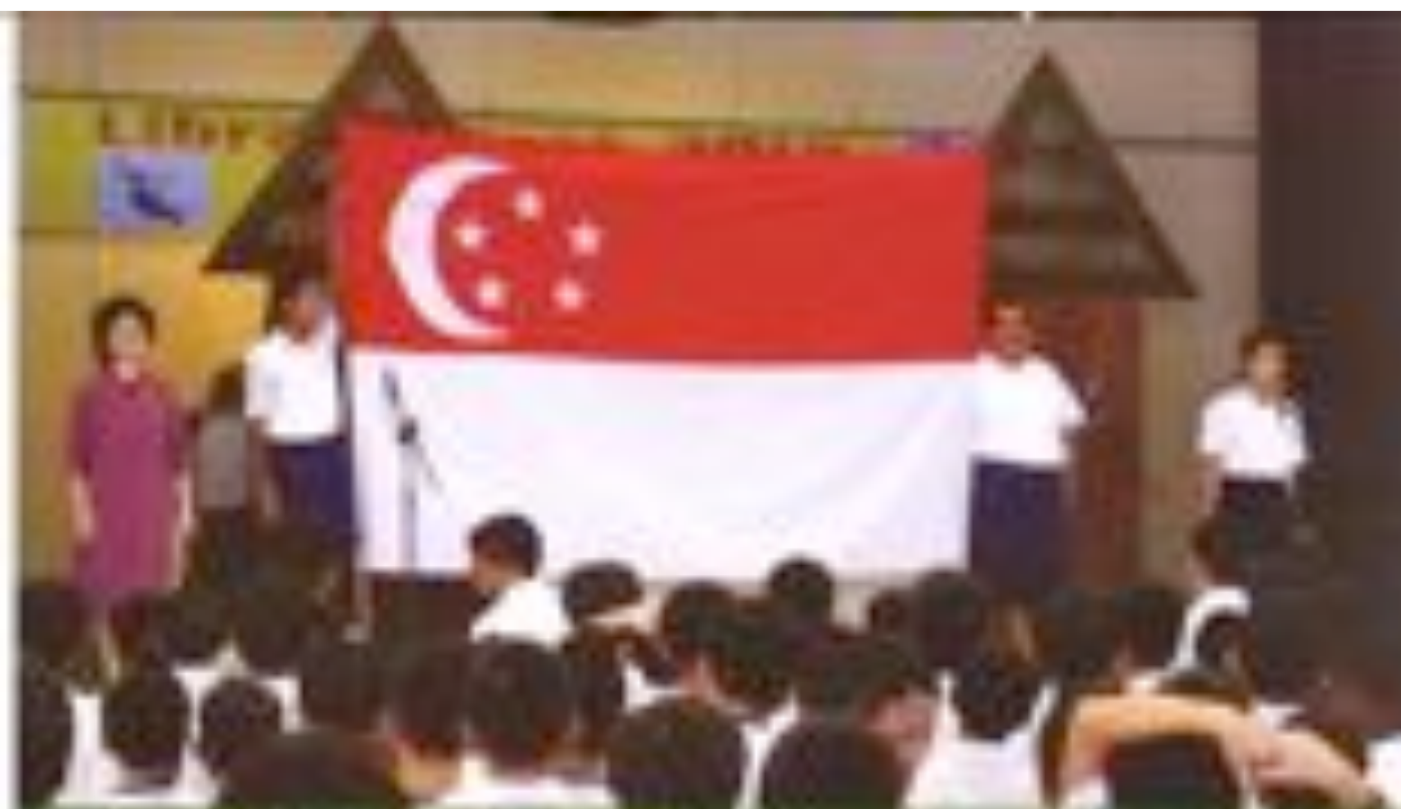
Our flag flies high!