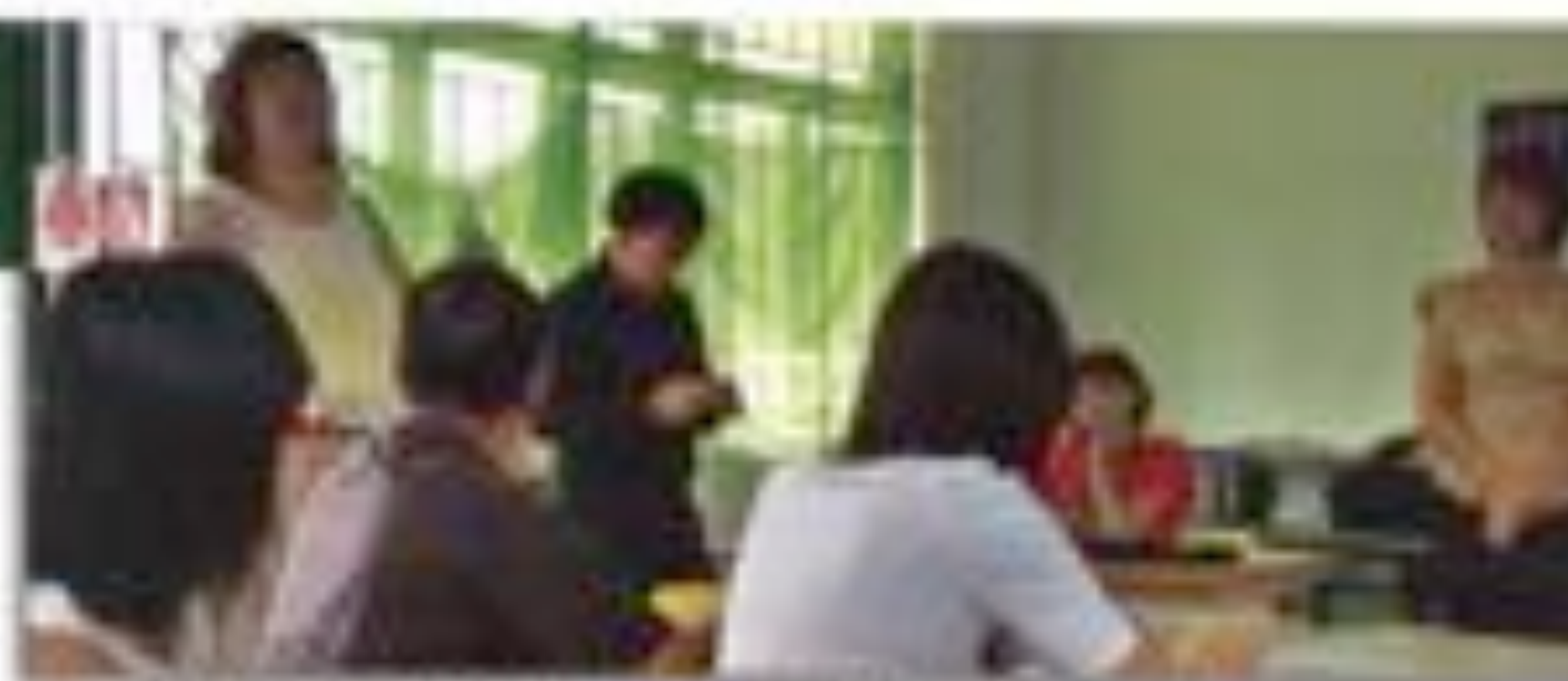
De La Salle teachers share their expertise in musical productions

As a Lasallian fraternity, we have much to learn from each other. This was marked by the first Christian Brothers Schools Key Personnel Learning Day held at S.B Junior. Each Primary CBS presented three of their areas of strength. These included sharing sessions on topics such as 'Improving writing in EL', 'Reflecting, Inquiring and Sharing for Pupil Engagement' and 'Raising the Standard of CI' among many others.