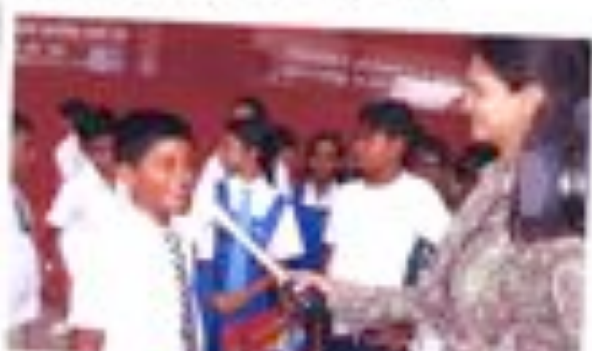
A Stephenian getting introduced at the Interactive Forum

Pupils learnt how to use Tamil touch-typing software, Murasu Anjal.