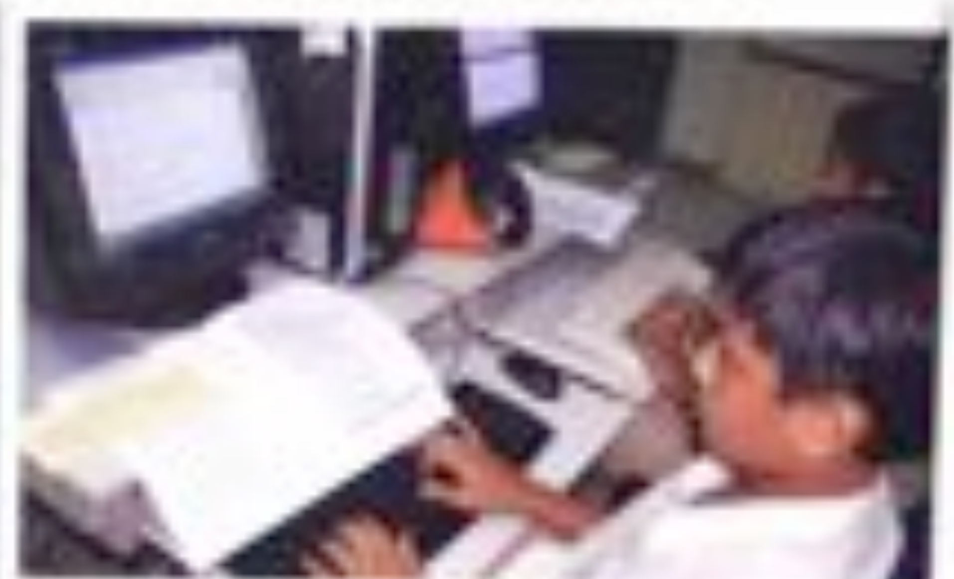
Typing in Tamil for the first time