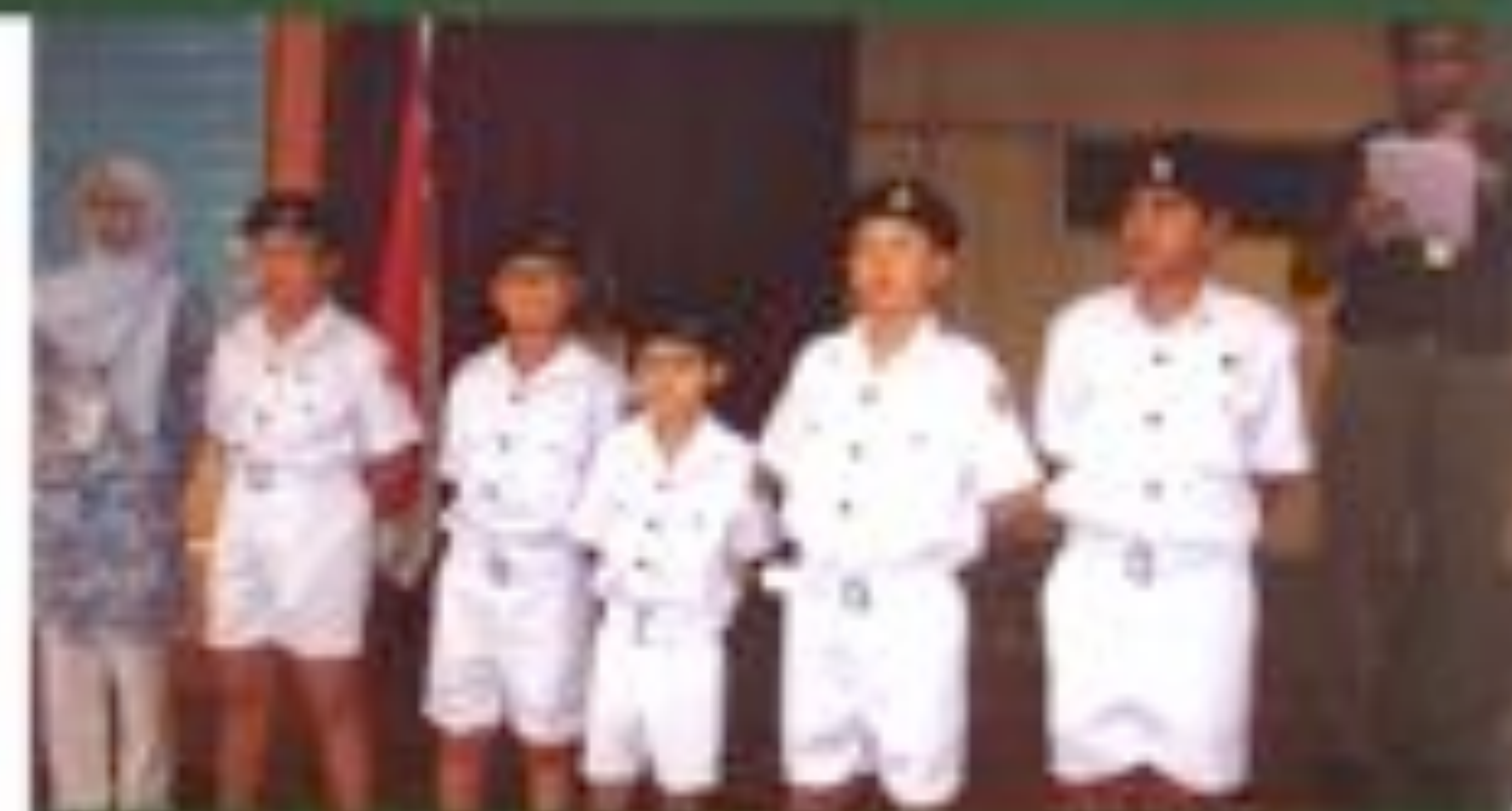
Our smartly-dressed Red Cross Links