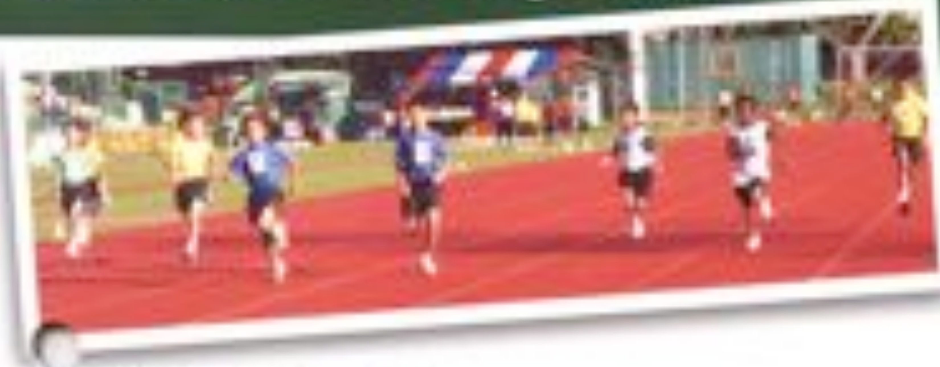
"I'm going to be Champion!"