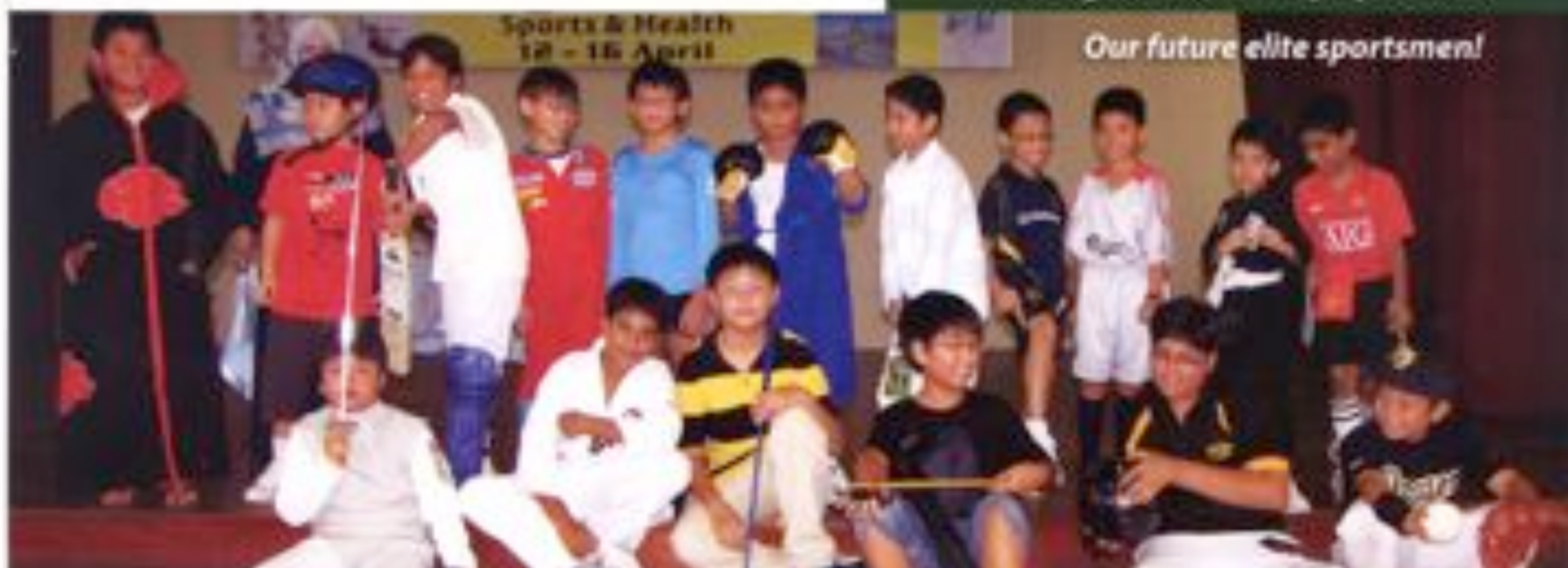
Our future elite sportsmen!