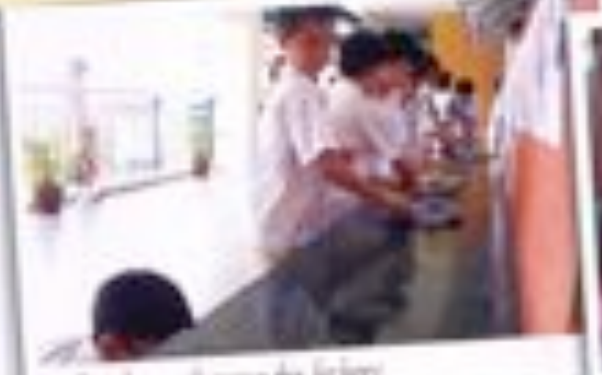
Our boys sharing the lessons

At the event organised by the Grassroots Organizations and the Home Team agencies, some of our P4 pupils were equipped with basic emergency response skills.