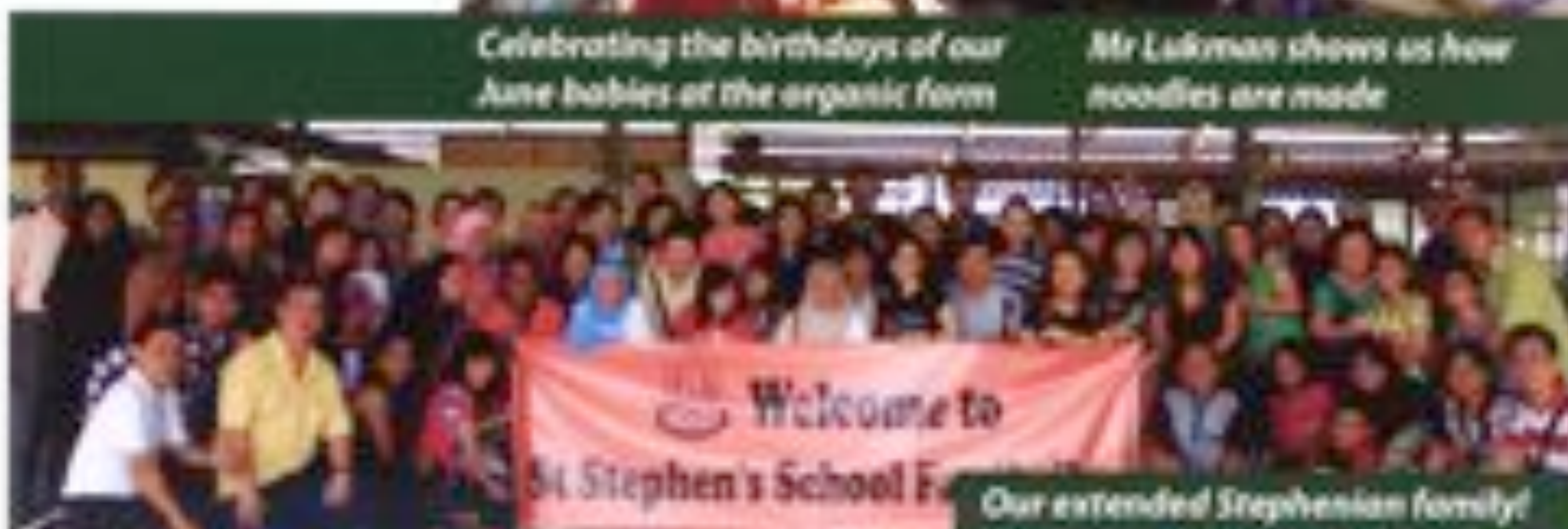
Our extended Stephenian family!