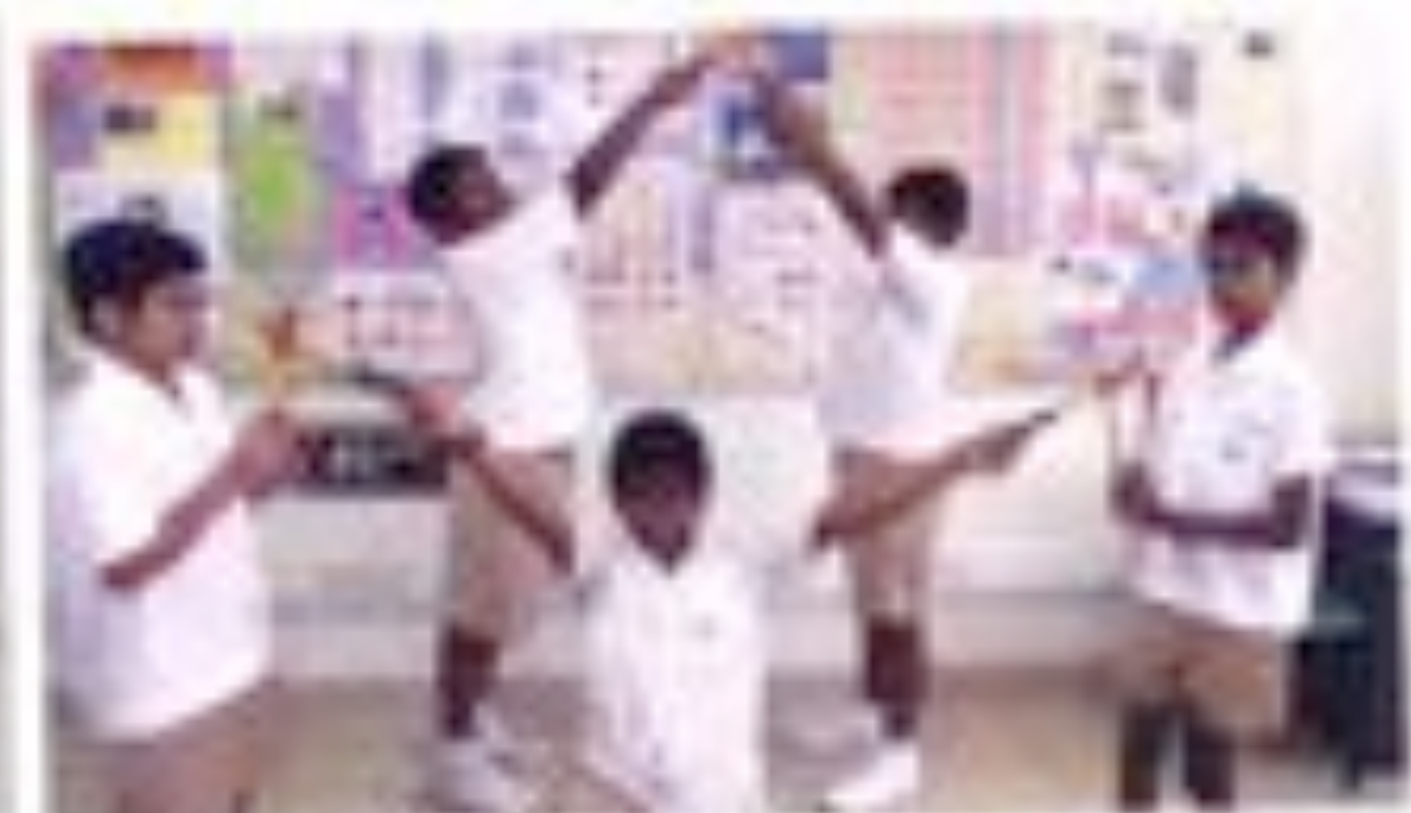
Learning Tamil through fun and games