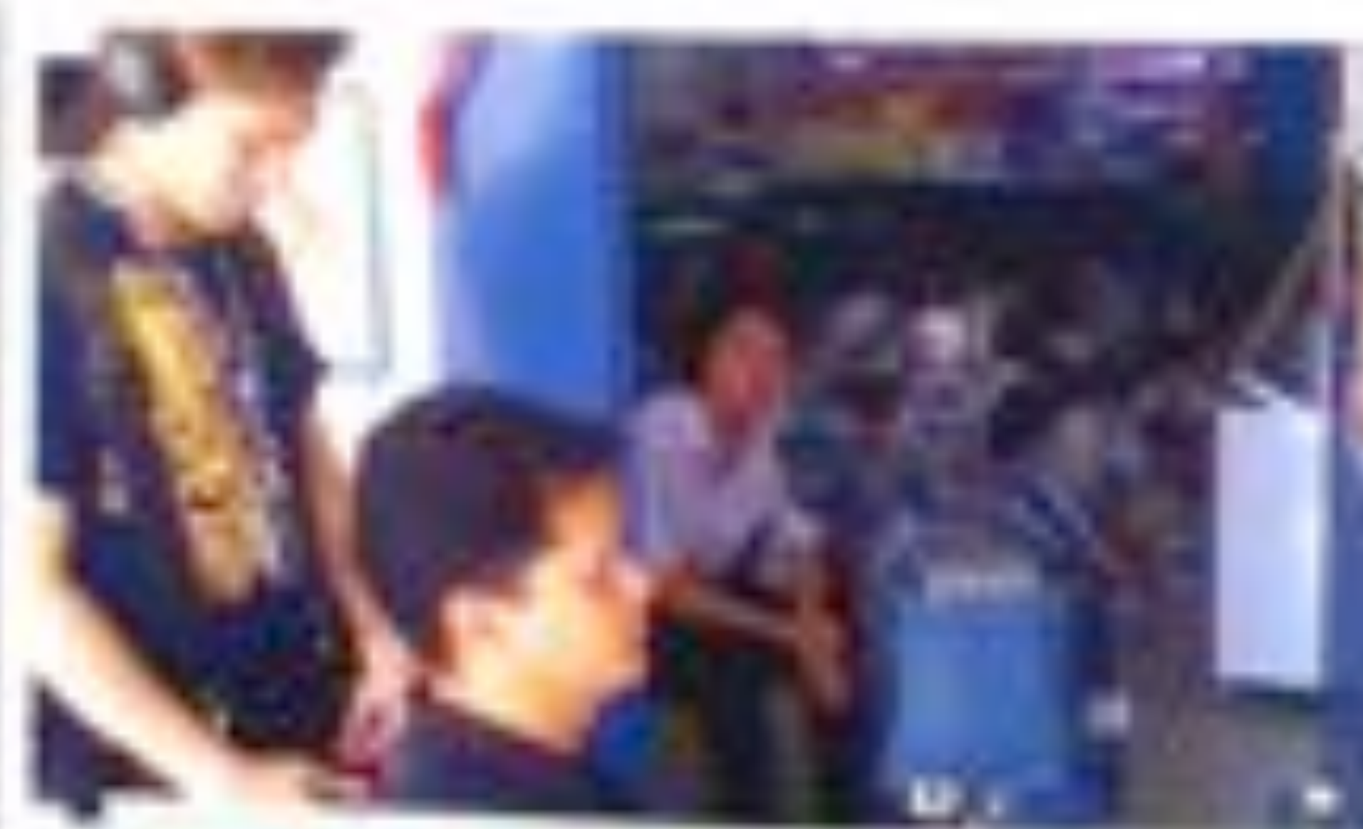
We were featured in Channel News Asia for our Bilingual Approach in the teaching of Chinese Language

National Chinese Language Photography Competition