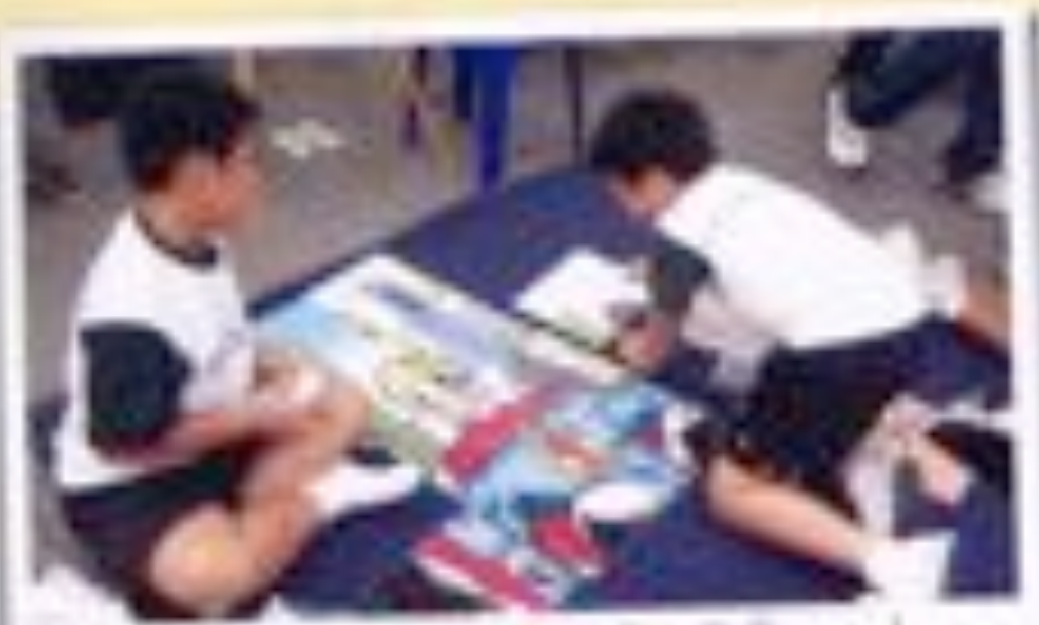
Our boys peering a quiz on Fire Safety together

Booths were set up in the canteen where pupils could view a paper-recycling demonstration and a display on Global Warming.