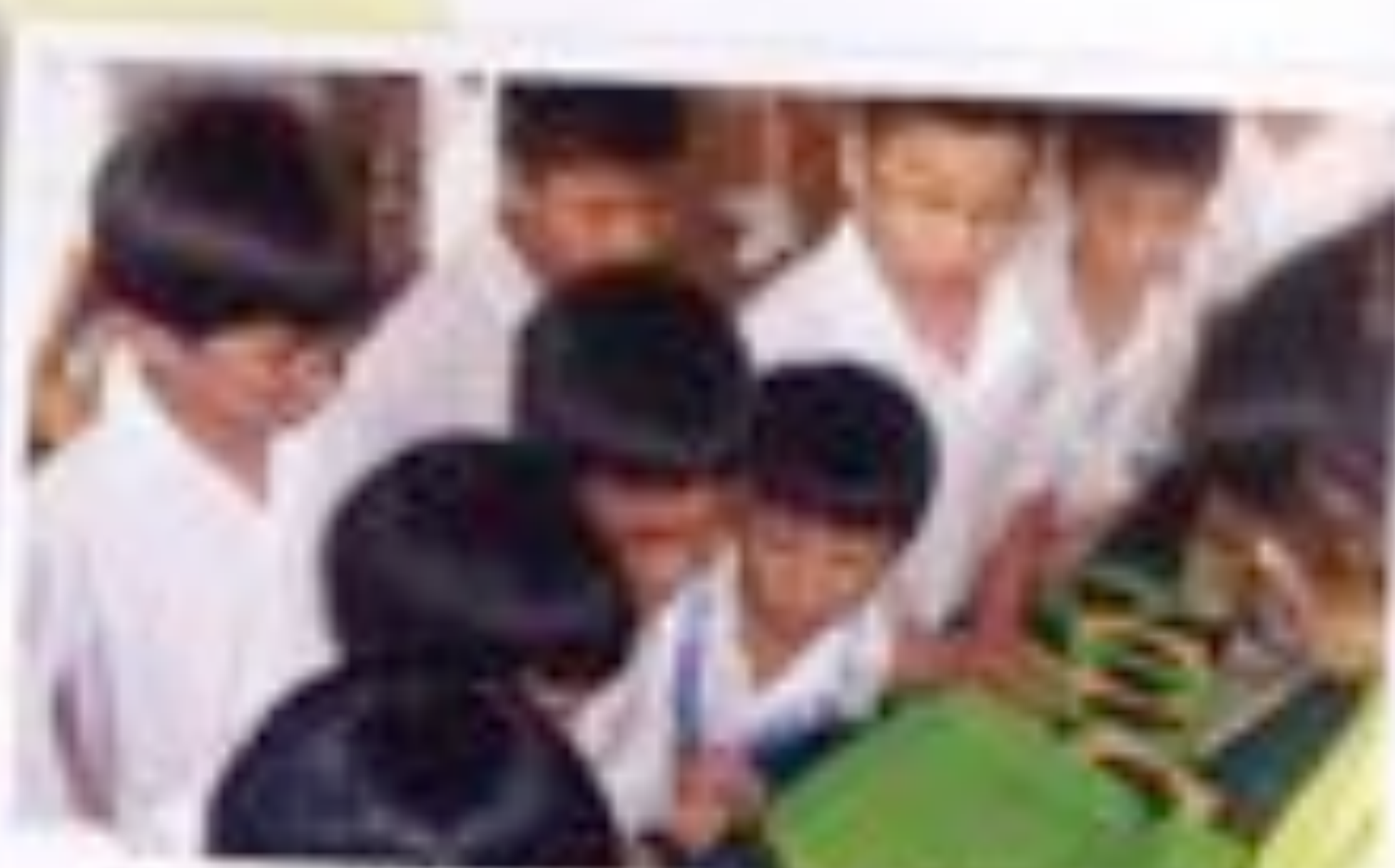
Captured boys at the paper recycling booth