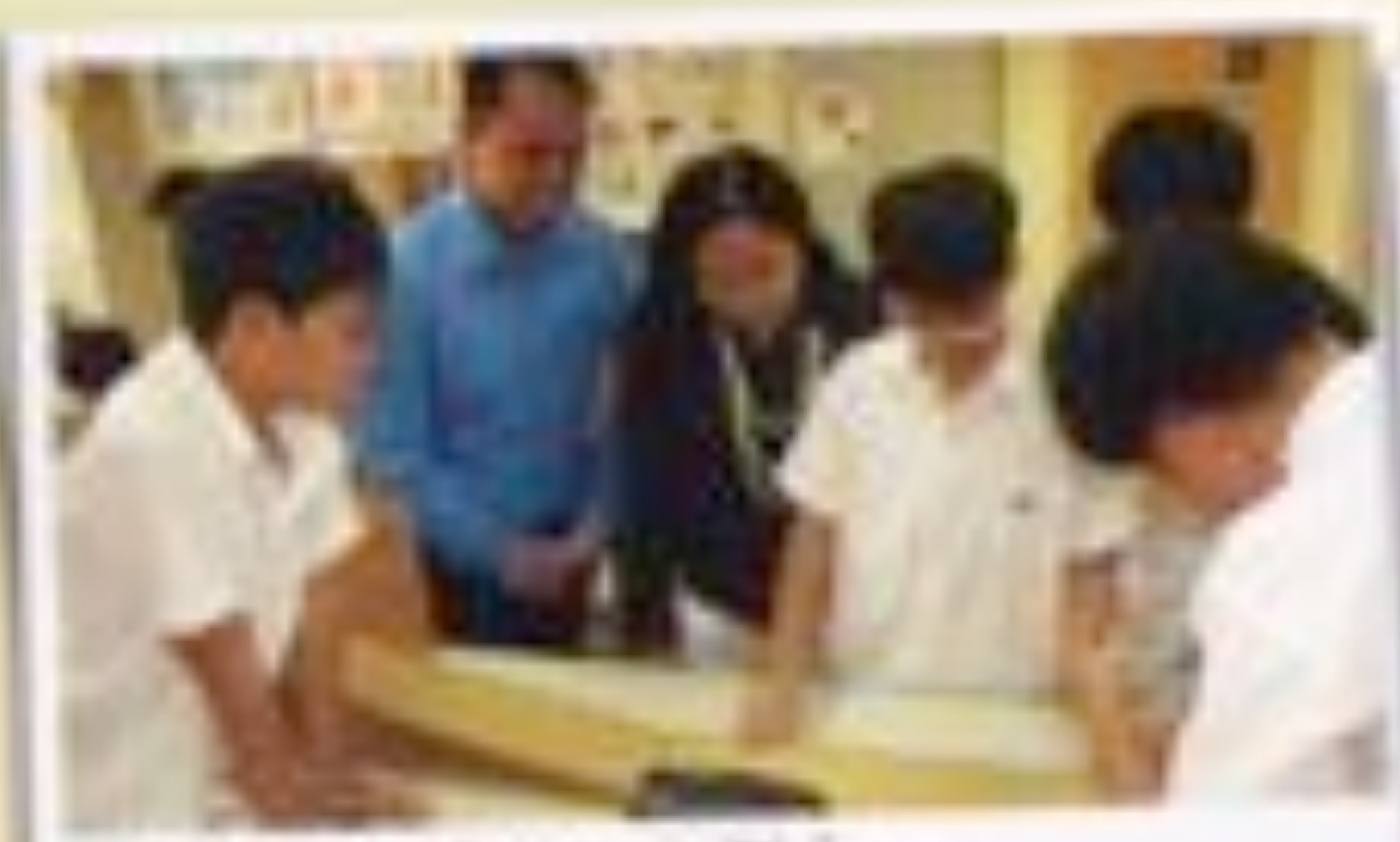
Our visitors observing a PB lesson