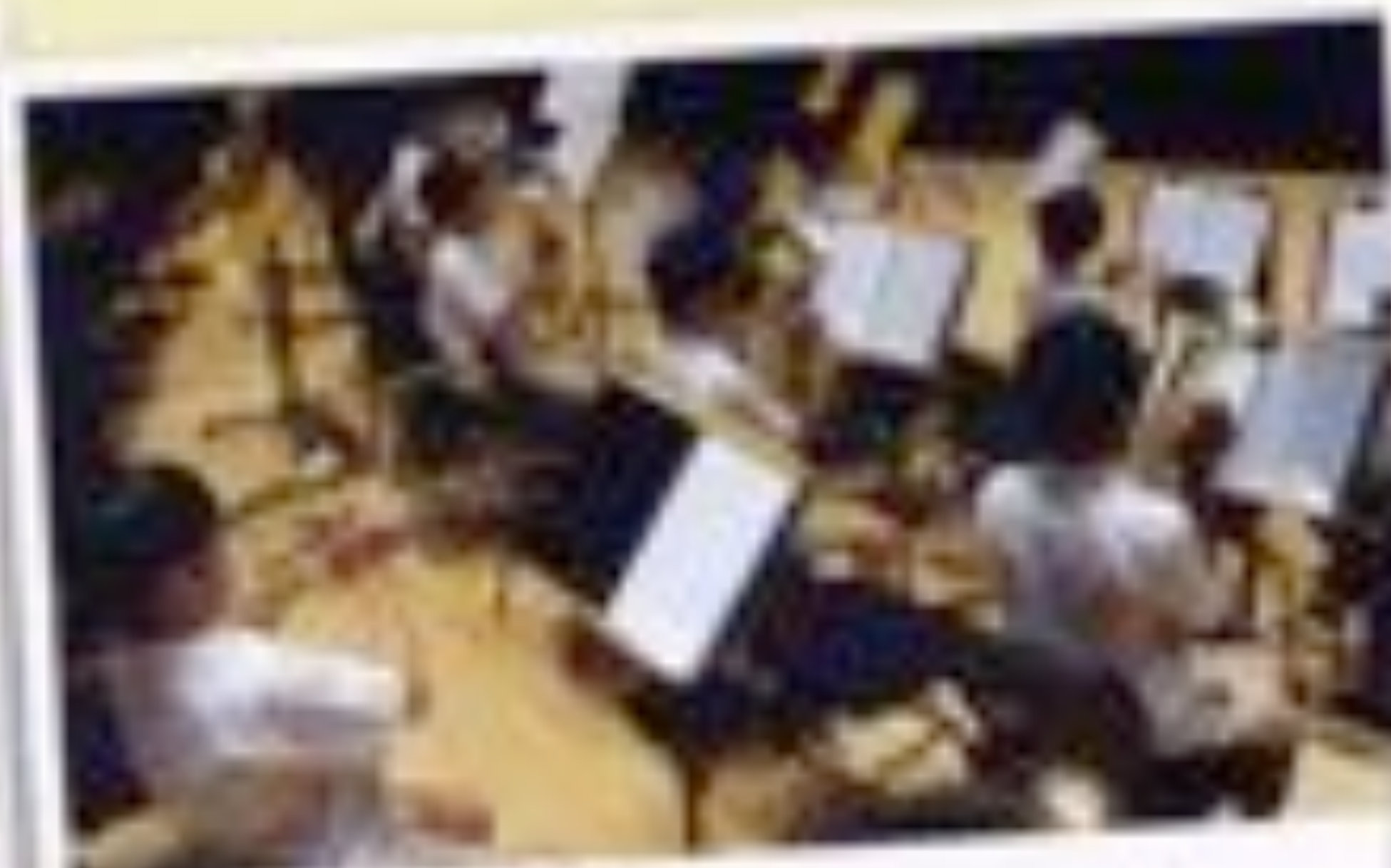
Presenting the Gold award-winning St Stephen's Brass Band

Our pupil ambassadors had an interactive time with our visitors from Philadelphia High School from the Philippines.